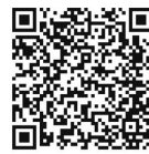
Scan Me To Help Work Spring Fling

Bags or Washers Tournament: Price, $50 to sign up during the spring fling. Winning Teams from each event will receive a $100 prize.